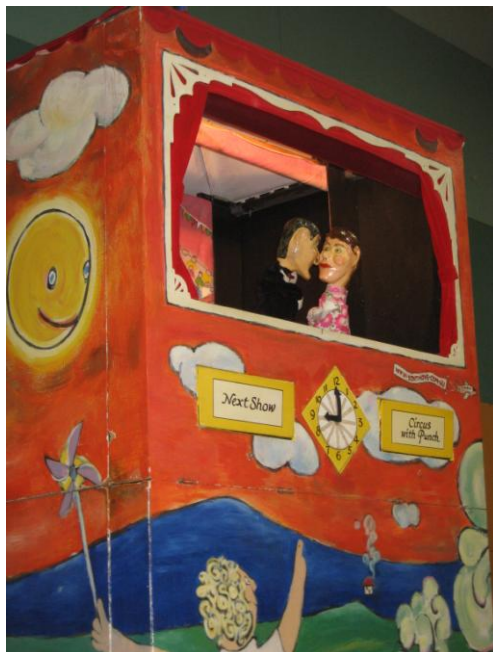
(Level 3's enjoyed the Puppet Show on Tuesday)