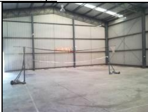
(Volleyball set up in the new improved big shed!)